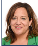
GARCÍA PÉREZ Iratxe President

EU leaders have taken an important step forward in committing to a climate neutral Europe by 2050. The framework and some of the tools to achieve climate neutrality are there in the European Green Deal, and now so is the political will. But we also need the resources to match our ambitions. Leaders stressed the importance of a Just Transition and the S&D Group could not agree more. If we are going to make sure that no one and no region is left behind, we need to agree on a fit-for-purpose long-term budget that guarantees a fair transition towards a greener future in Europe.